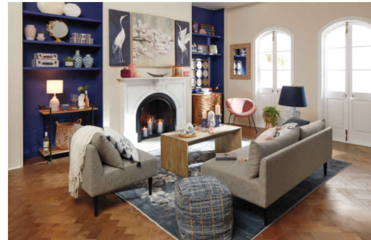
Tracey Boyd's exclusive collection with At Home is inspired by travel, art and adventure.

This press release features multimedia. View the full release here: https://www.businesswire.com/news/home/20210222005603/en/